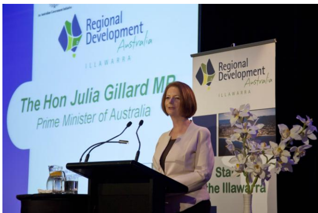
Prime Minister of Australia, the Hon Julia Gillard MP addresses the summit.