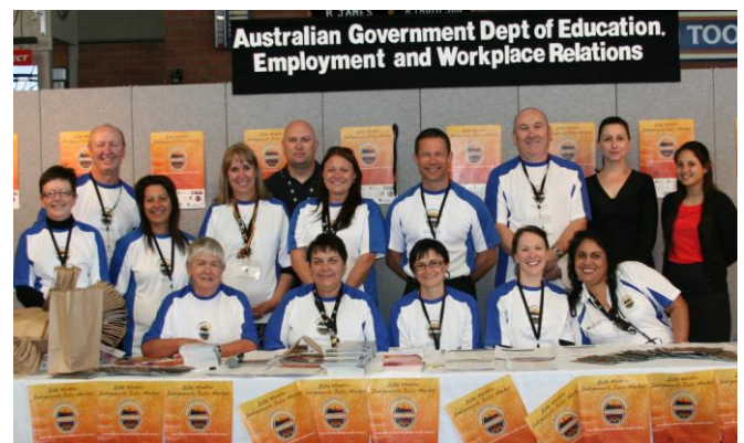
The Department of Education, Employment and Workplace Relations booth at the Hunter Indigenous Jobs Market.

Students could speak directly with more than 40 exhibitors from education, training, business and industry sectors. Feedback from previous similar events has indicated that more than 50 young people were placed in jobs.